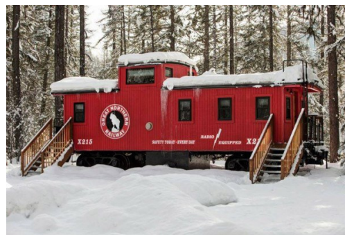
Izaak Walton Inn

This caboose that zoomed through Essex in 1941 belonged to a Great Northern X215. It has been converted into something really special for this hotel.