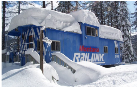
Izaak Walton Inn

The hotel also boasts other converted cars, like the JJ, Green, and Orange cabooses.