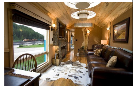
Izaak Walton Inn

This car represents the diesels that once rolled past the Izaak Walton Inn every day.