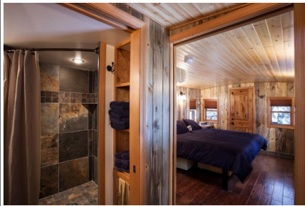
Izaak Walton Inn

A family can keep cozy in this renovated caboose that has a fully equipped kitchen, two sets of bunk beds, and a queen-sized bed with a gas fireplace in the master bedroom.