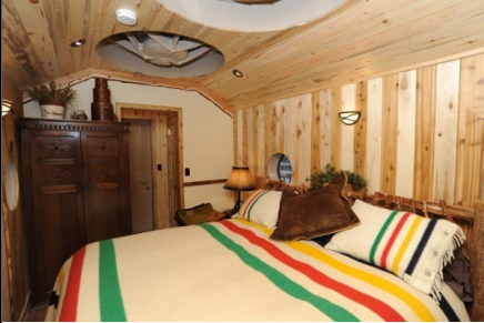
Izaak Walton Inn

Each car boasts lovely, rustic details as well. The birch walls in this car accent the 400-year-old reclaimed oak floor.