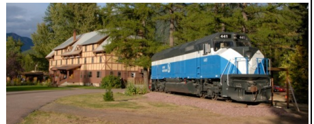
Izaak Walton Inn

The GN X215 Caboose isn't the only reason why train buffs are attracted to this inn. There are other beautifully restored cars on the premises as well, like the Great Northern 441 Locomotive.