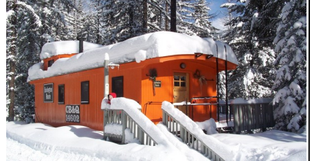
Izaak Walton Inn

Nowadays, though a track still runs by Essex, Amtrak only stops when there are passengers waiting.