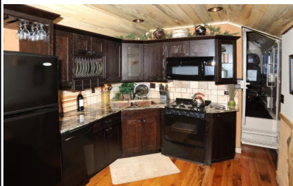
Izaak Walton Inn

This larger car can hold up to two couples or a small family. The modern kitchen is the perfect place to cook up some fresh, river-caught trout.