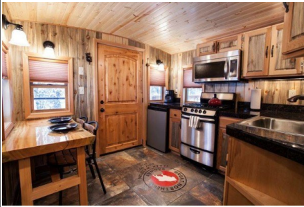
Izaak Walton Inn

It's a beautiful and modern dwelling that can house up to six. Once you step inside, you almost forget that you're standing in the belly of a caboose.