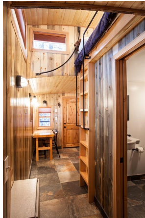
Izaak Walton Inn

This 60,000-pound rail car was hoisted by crane before it was trucked to Essex.