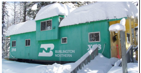
Izaak Walton Inn

Although it never became the third entrance to Glacier National Park, the stop has become important over time, especially for BNSF Railway Co. freight trains that need helper engines to push their heavy loads over Marias Pass.