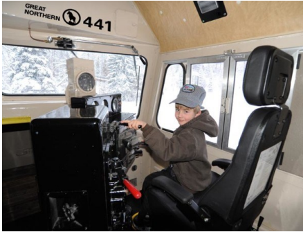
Izaak Walton Inn

This car, obviously the conductor's locomotive, still retains some of its original parts. Kids love the train cars, too," Wright noted.